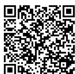
Academic Resource Manual