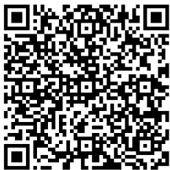
Social Event Toolkit