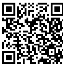
OFSL Resource Manual